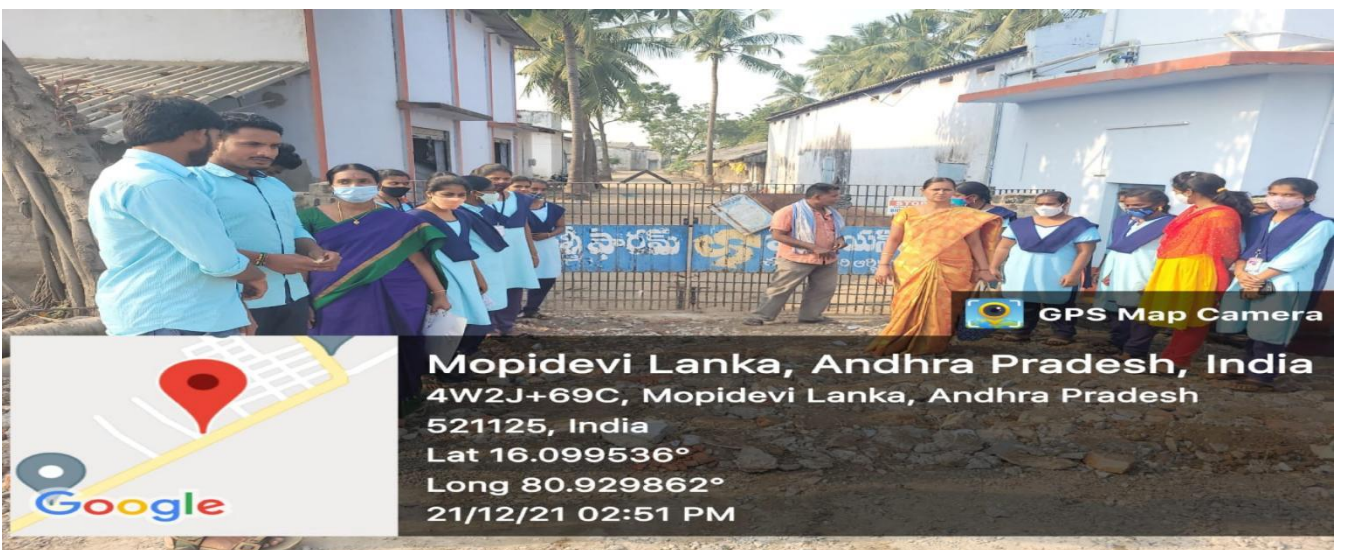
SANTHI POULTRY FARM ----KAPTHANUPALEM ENTERY TO THE POULTRY FARM