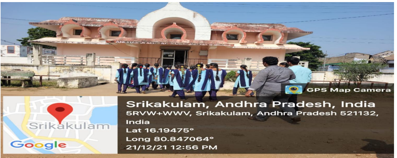
BOUDDA MUSIUM GHANTASALA ; STUDENTS VISIT BOUDDAMUSIUM AND APPRICIATE BOUDDA SCPLTURE